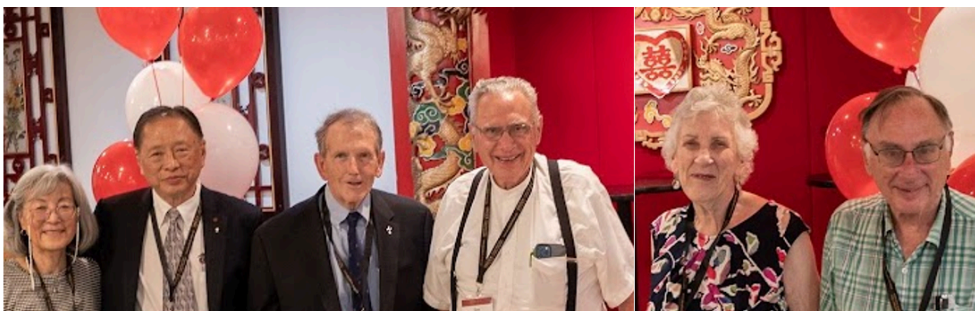
USCCA Directors celebrating the 35th anniversary of USCCA at the 2024 Conference banquet

"The USCCA Conference inspired me to learn more about the church in China, especially the social service opportunities the brave Catholics have taken on.... was so encouraged by what Christians in China are doing, and it inspired me to do more myself."