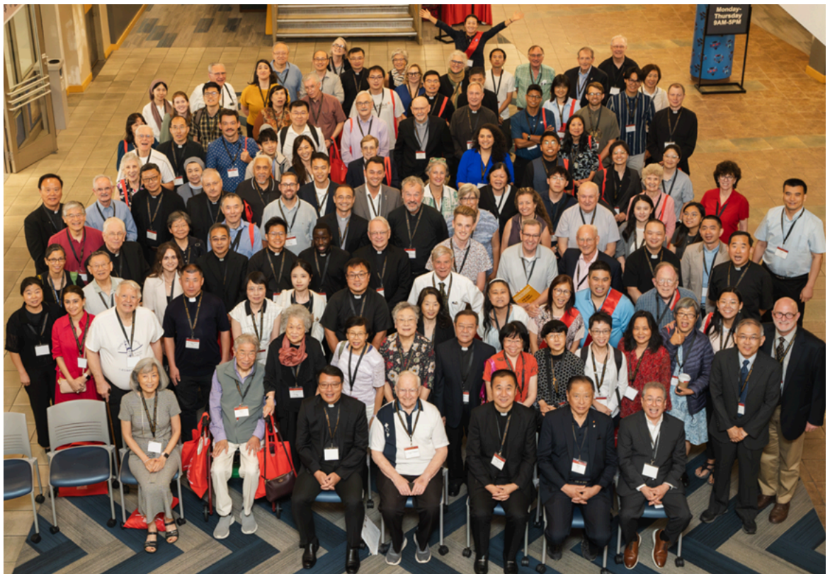
Participants of the 2024 USCCA International Conference DePaul University, Chicago, IL, USA

The 29th International Conference reaffirmed the USCCA as a “culture and community of encounter”.