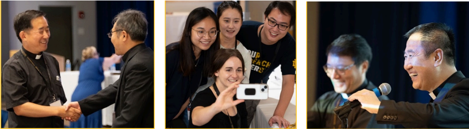
Meeting old friends and making new ones at the Conference

"...the conference illustrated the importance of direct dialogue between Chinese and American Catholics. It was a unique experience of fraternal communion and friendly dialogue across borders."