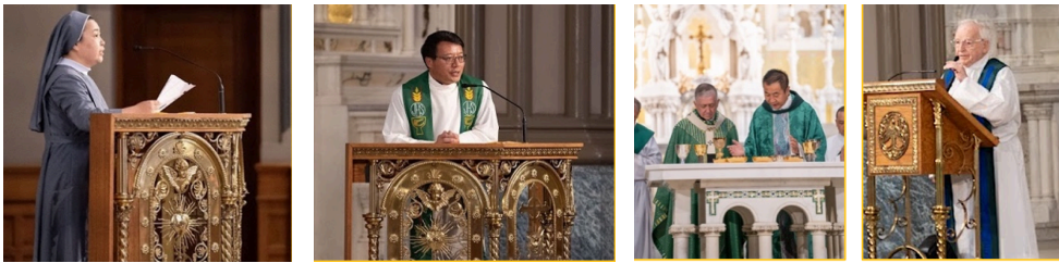
Conference Mass at the St. Vincent DePaul Church

"There were wonderful insights into the dedication of the Catholics supporting Sino-Western friendship, the integrity and ecumenicity of the USCCA."