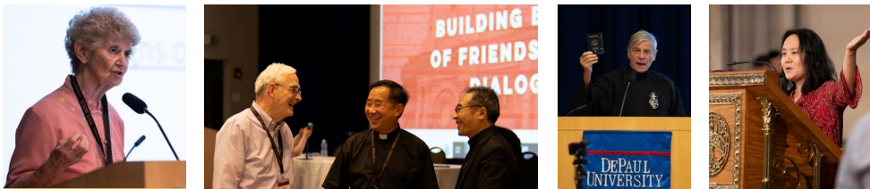
Speakers at the 2024 USCCA Conference

"I could not help but feel the presence of the Holy Spirit in the USCCA's work and commitments. This was a manifestation of hope."