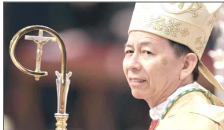
Archbishop Savio Hon

There are people in America and Europe who are pushing Chinese bishops towards this kind of action. "If you succeed," they argue, "we will follow." [1]